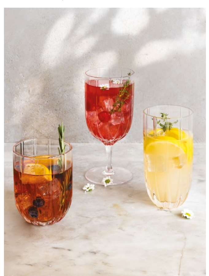
Righe Handmade in blown glass